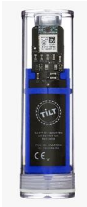
Figure 1: Tilt Hydrometer

The hydrometer we will be developing will not use a battery. It will be able to take the readings that the Tilt hydrometer can take and will have wireless communication with a user interface. Because the hydrometer we have designed is battery less it will implement an energy harvester to wirelessly receive energy. This will mean less user maintenance.